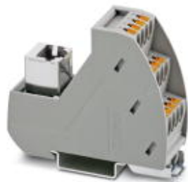
VARIOFACE module with push-in connection and RJ45 connector

Please be informed that the data shown in this PDF Document is generated from our Online Catalog. Please find the complete data in the user's documentation. Our General Terms of Use for Downloads are valid ( http://phoenixcontact.com/download )