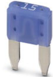
Fuse, nominal current: 15 A, length: 11.9 mm, width: 3.8 mm, height: 16.2 mm

Please be informed that the data shown in this PDF Document is generated from our Online Catalog. Please find the complete data in the user's documentation. Our General Terms of Use for Downloads are valid ( http://phoenixcontact.com/download )