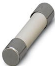
Output fuse (5x20 mm) acc. to IEC 127-2/EN 60127-2, 2 A fast blow

Please be informed that the data shown in this PDF Document is generated from our Online Catalog. Please find the complete data in the user's documentation. Our General Terms of Use for Downloads are valid ( http://phoenixcontact.com/download )