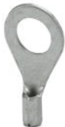
Ring cable lug, non-insulated, 0.5 ... 1 mm 2 , M6

Please be informed that the data shown in this PDF Document is generated from our Online Catalog. Please find the complete data in the user's documentation. Our General Terms of Use for Downloads are valid ( http://phoenixcontact.com/download )