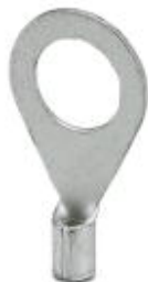
Ring cable lug, non-insulated, 1.1 ... 2.5 mm 2 , M8

Please be informed that the data shown in this PDF Document is generated from our Online Catalog. Please find the complete data in the user's documentation. Our General Terms of Use for Downloads are valid ( http://phoenixcontact.com/download )