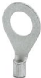
Ring cable lug, non-insulated, 2.6 ... 6 mm 2 , M10

Please be informed that the data shown in this PDF Document is generated from our Online Catalog. Please find the complete data in the user's documentation. Our General Terms of Use for Downloads are valid ( http://phoenixcontact.com/download )