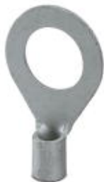
Ring cable lug, non-insulated, 10 mm², M12

Please be informed that the data shown in this PDF Document is generated from our Online Catalog. Please find the complete data in the user's documentation. Our General Terms of Use for Downloads are valid ( http://phoenixcontact.com/download )