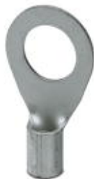
Ring cable lug, non-insulated, 16 mm², M12

Please be informed that the data shown in this PDF Document is generated from our Online Catalog. Please find the complete data in the user's documentation. Our General Terms of Use for Downloads are valid ( http://phoenixcontact.com/download )