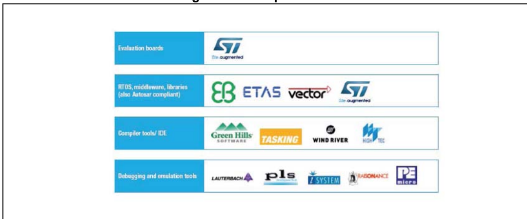
Figure 2. Third parties tools

A set of ST and third parties tools are available to explore the product family starting from budgetary cost evaluation boards to top class solutions.