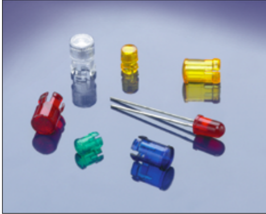
U.S. & Foreign Pat. Pend.