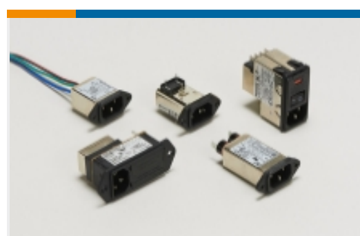
Multi-Function Inlet Filters(45)