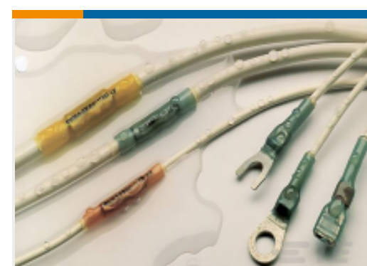
TE Part #157013-000 B-106-1502-S