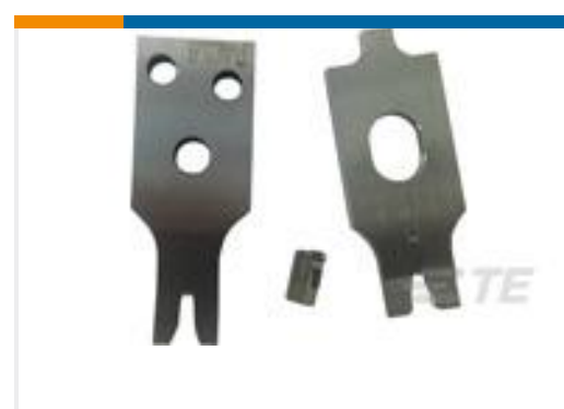
TE Part #7-2151023-7 OCEAN_2.0_SPARE_PART_KIT-080F1200