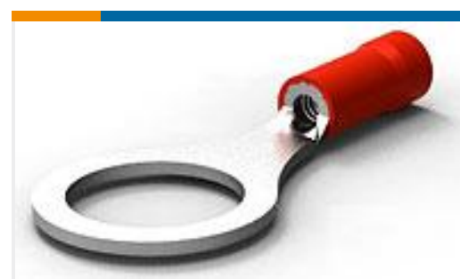
TE Part #34152 PG R 22-16 COMM 22-18 MIL 3/8