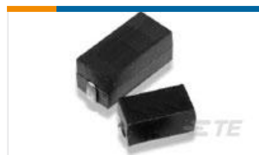
TE Part #6-1879233-1 SMW5 33R 5%