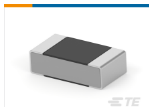
TE Part #9-1879140-4 RN 0603 174K 0.1% 10PPM 5K RL