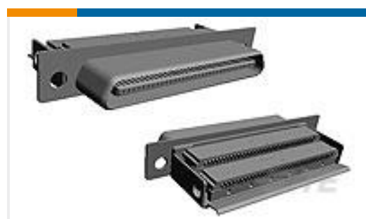
TE Part #5787775-1 68.8MM CHAMP OFFSET CBL KIT