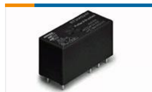
TE Part #2-1419108-9 RTD14012F