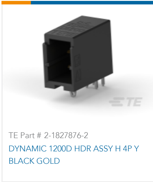
TE Part # 2-1827876-2 DYNAMIC 1200D HDR ASSY H 4P Y BLACK GOLD