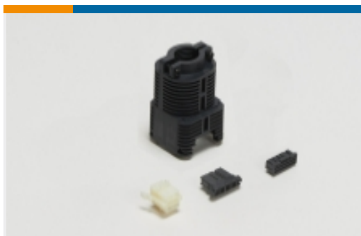
Rectangular Connector Housings(2)