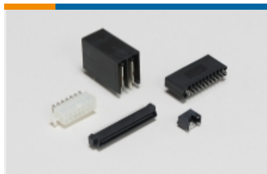
Standard Rectangular Connectors(4)