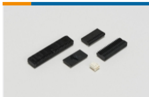
Wire-to-Board Connector Assemblies & Housings(159)