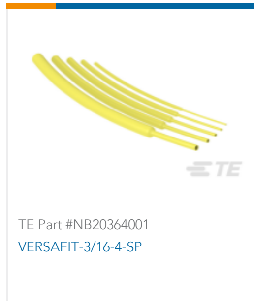
TE Part #NB20364001 VERSAFIT-3/16-4-SP