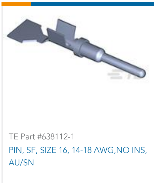
TE Part #638112-1 PIN, SF, SIZE 16, 14-18 AWG,NO INS, AU/SN