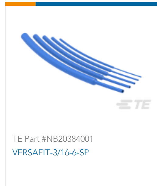
TE Part #NB20384001 VERSAFIT-3/16-6-SP