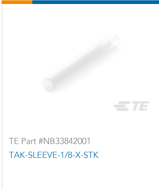
TE Part #NB33842001 TAK-SLEEVE-1/8-X-STK