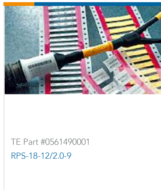
TE Part #0561490001 RPS-18-12/2.0-9